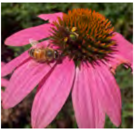
Bees collecting nectar from a coneflower.