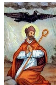
Saint Medard, Pray for Us.

Let's pray to this sixth century bishop for a sunny September 7 th !