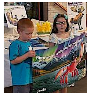
Bible Buddy Clawdia knows that when we are alone we can trust Jesus.