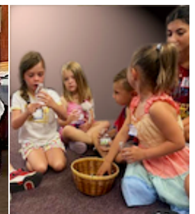
Wild Bible Adventures at True North, this summer's VBS camp.